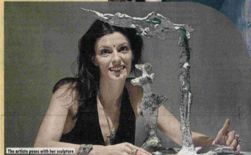
The artiste poses with her sculpture